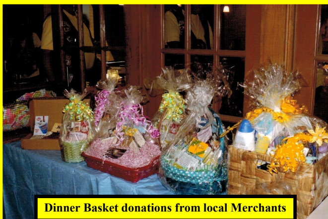
Dinner Basket donations from local Merchants